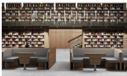
Study Pods in a library.