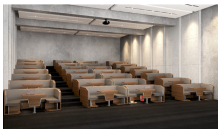
Study Pods in a lecture theatre.