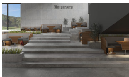
Study Pods in a corridor.