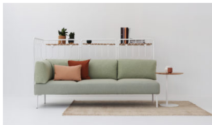
Pillows in a Kove modular sofa.