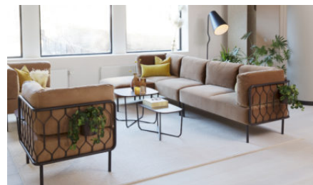
Kove sofa with cushions.