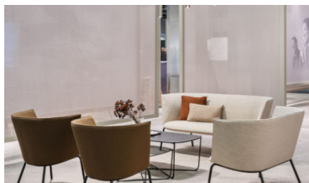
A Tind seating area with cushions from For Form.