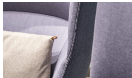
Fora Form cushion with leather detail in a Tind chair.