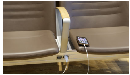
Charging option on Transeat in OSL