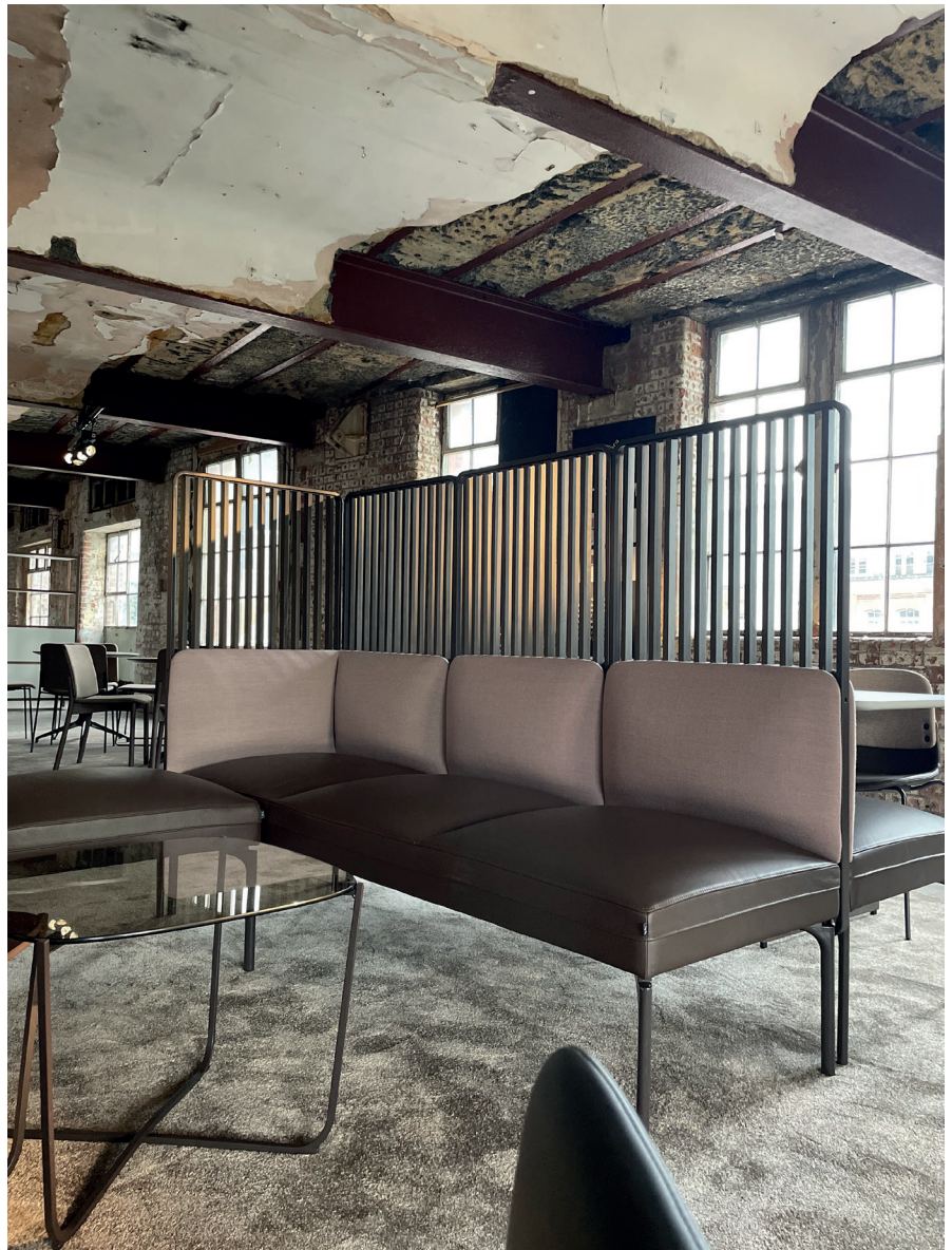
Senso Frame sofa

Fora Forms exhibition will be located on the 3rd floor of Bargehouse, and we will be showing a variety of furniture from our collection, adding some of our newest additions such as Senso Frame, Atrium- and Dwell chairs. Through the selected items we hope to be able to shine light on why the material intelligence truly matters, and how they may be a part of shaping our future, together with our furniture.